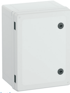
Cat No. 710-734 GEOS-S 3040-22-o with grey cover