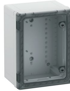
Cat No. 711-734 GEOS-S 3040-22-to with transparent cover