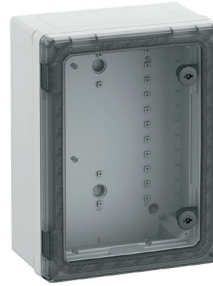
Cat No. 711-434 GEOS-S 3040-18-to with transparent cover