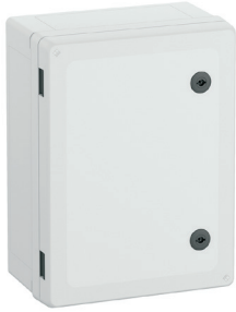
Cat No. 710-434 GEOS-S 3040-18-o with grey cover