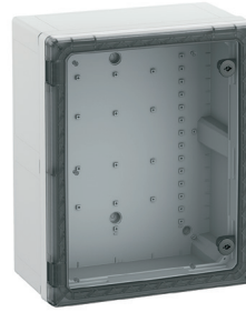
Cat No. 711-745 GEOS-S 4050-22-to with transparent cover