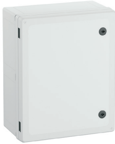
Cat No. 710-745 GEOS-S 4050-22-o with grey cover